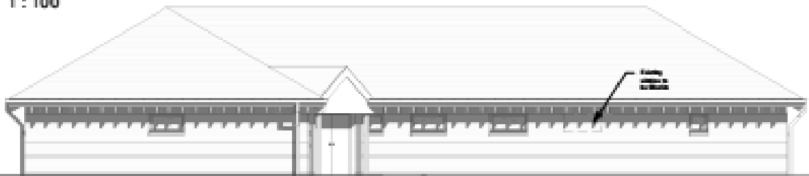
Proposed East Elevation